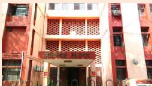
The Science block of IIT (ISM) Dhanbad.

After allegations of image duplication, 14 papers published by two faculty members of the institute were retracted and two others were corrected.