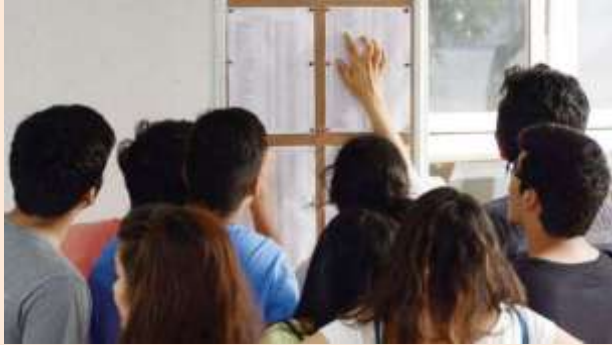
(JEE, NEET dates announced)

https://www.dnaindia.com/india/report-government-announces-dates-for-neet-jee-main-2019-check-exam-dates-and-schedule-2652869