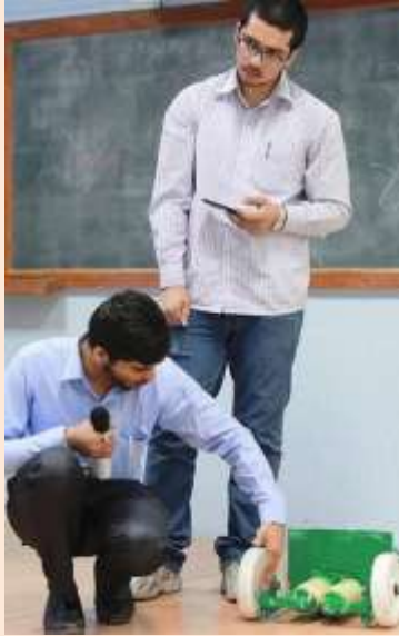
The team from IIT-Jammu with their weed remover prototype